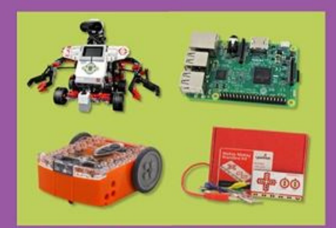
Self Guided Creator Kits (8+ years) available at Chatswood Library, including: Edison Bots, mBots, Makey Makey and Raspberry Pi.